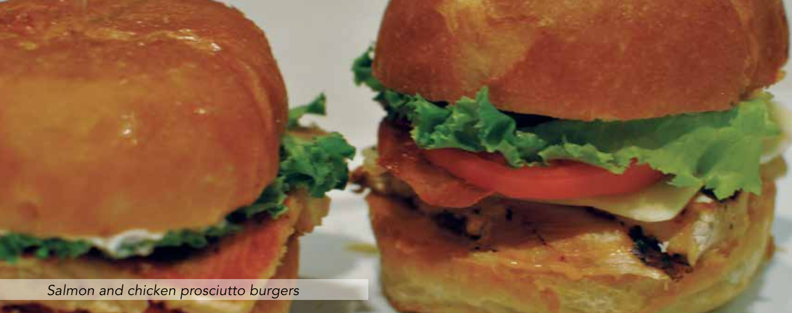
Salmon and chicken prosciutto burgers