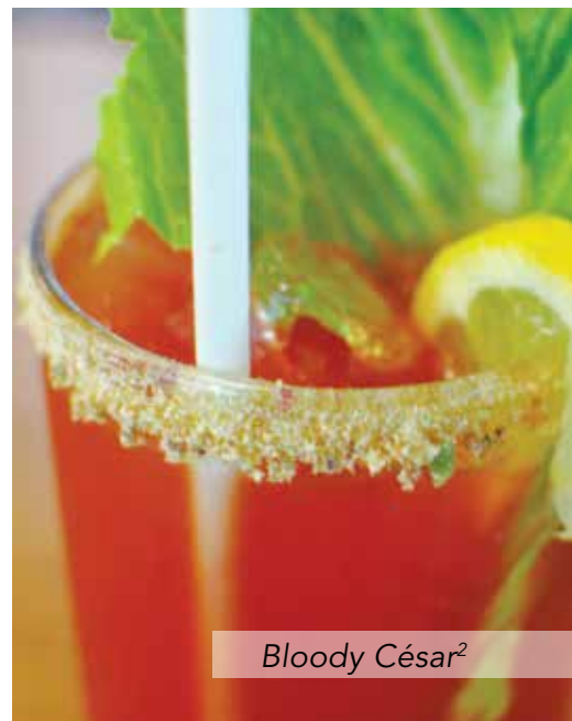
Bloody César 2