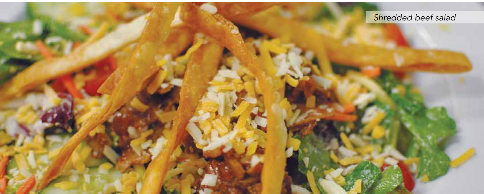
Shredded beef salad