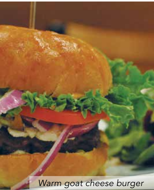
Warm goat cheese burger